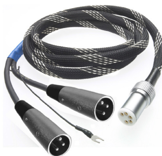
Connect it Phono DS 5P/XLR: separately available upgrade cable for True Balanced phono connections