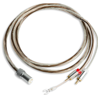
Connect it Phono E 5P/RCA included: Semi-balanced premium phono cable